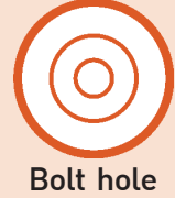
PLATE TYPE & DIMENSIONS (mm)