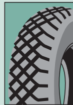
Diamond pattern available on request